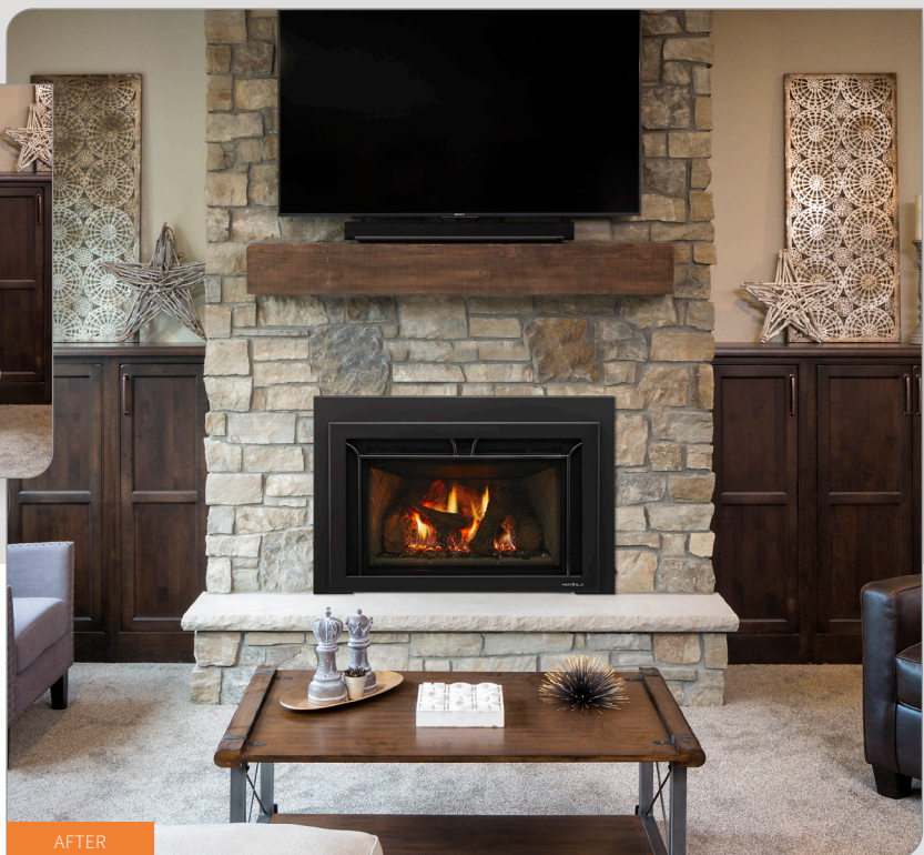
Shown: Supreme gas fireplace insert by Heat & Glo