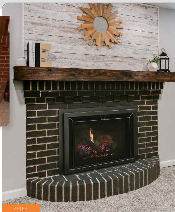
Shown: Supreme gas fireplace insert by Heat & Glo