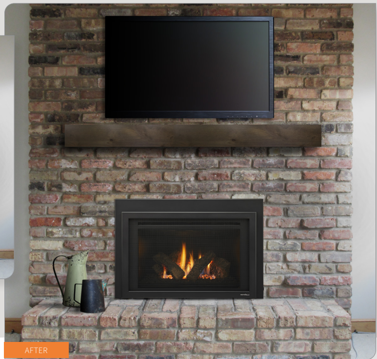
Shown: Provident gas fireplace insert by Heat & Glo